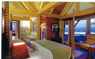
MAGNAN MCCLELLAND (TOP)

JUST DROPPING IN: BIGHORN OFFERS AN INTIME HELI-SKIING EXPERIENCE.